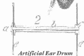
Artificial Ear Drum